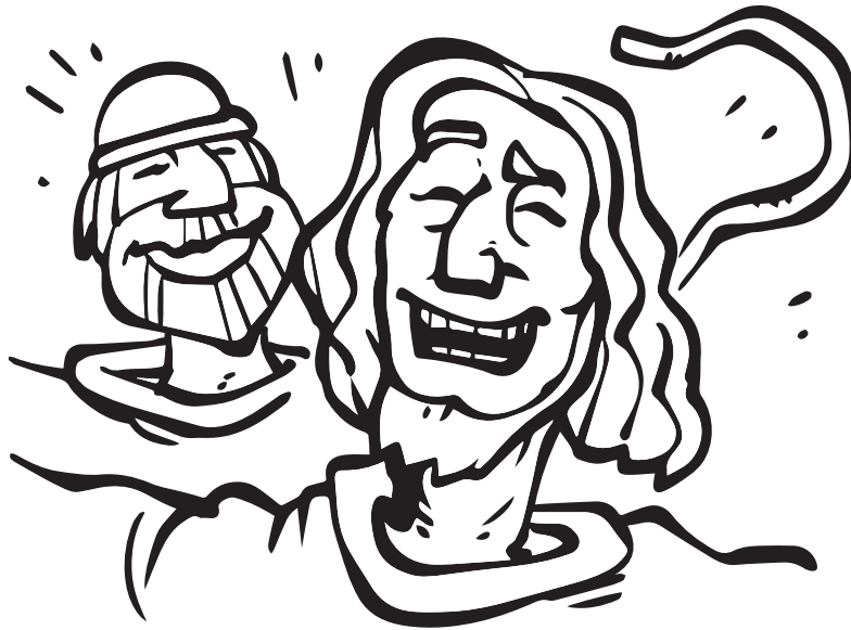
Shepherds praising God