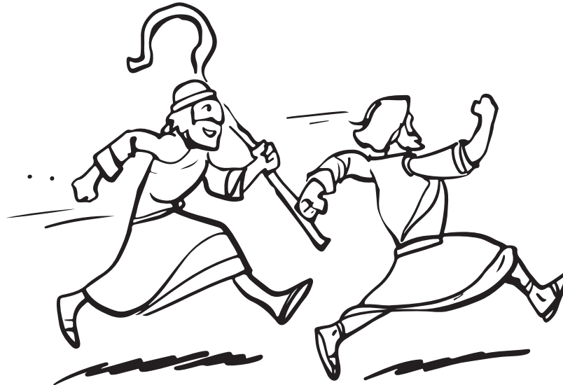
Shepherds running to Bethlehem to tell everyone what they saw