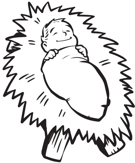
Baby Jesus lying in a manger