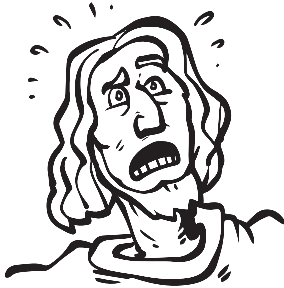
A terrified shepherd