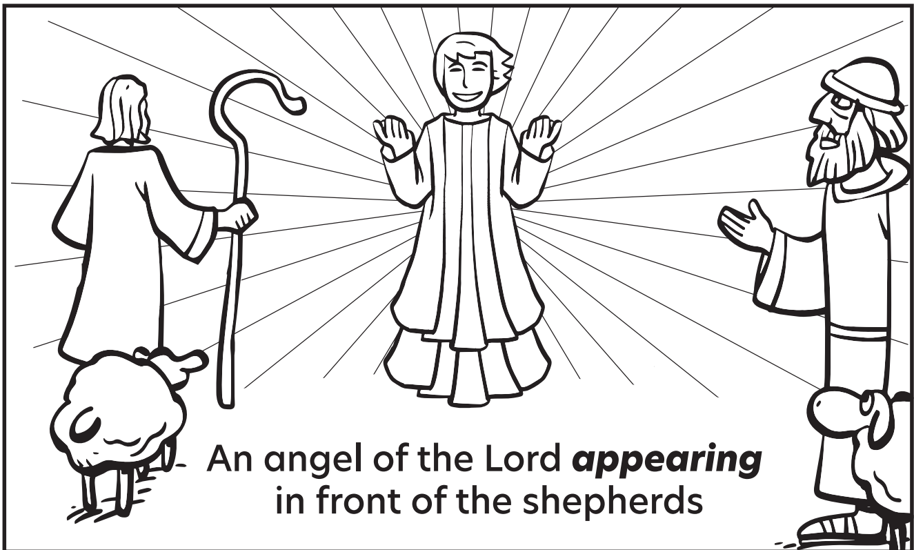
An angel of the Lord appearing in front of the shepherds